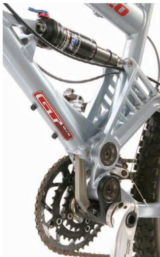
Compact flash: The latest incarnation of the GT i-Drive system is smaller, tighter and just as effective as the early versions. Flipping the ProPedal lever away from the chainrings turns on the ProPedal on this bike.

GT routes the front derailleur cable through the seat stays (behind the seat tube). It looks effective but puts the exposed cable in the path of everything flung off the rear wheel. We didn't have problems, but we are in the driest year on record in California. If you ride in messy conditions, you'll need to keep an eye on this cable if you want crisp derailleur operation.