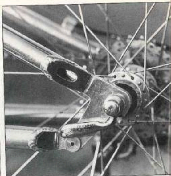
The heart of the matter: Whoomp... there it is! This is the authentic Horst Link. The wheel is attached to the seat stay. The dropout pivots below center and the swingarm is a short, straight link to the bottom bracket pivot.